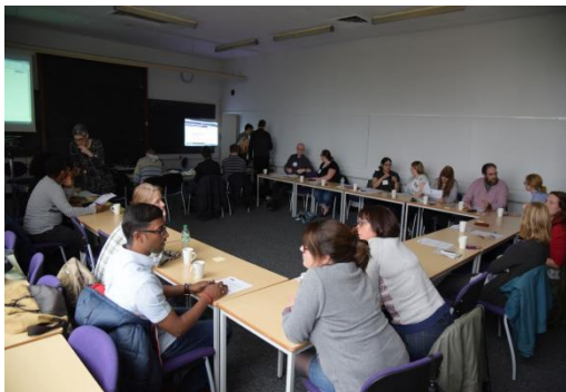
The 'Building Bridges' workshop

In January 2016 we arranged a series of workshops in an effort to bridge this gap. These workshops included a number of recorded discussions (called focus groups) with 10 autistic adults and 14 parents of autistic children. A further 13 autistic adults were later recruited at Autscope (which is a conference for autistic people, organised by autistic people).