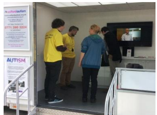
Public engagement at the Autism Conference 2017, Salford